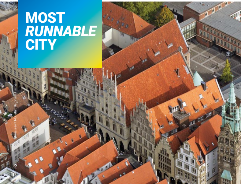
Picasso Museum, Münster View