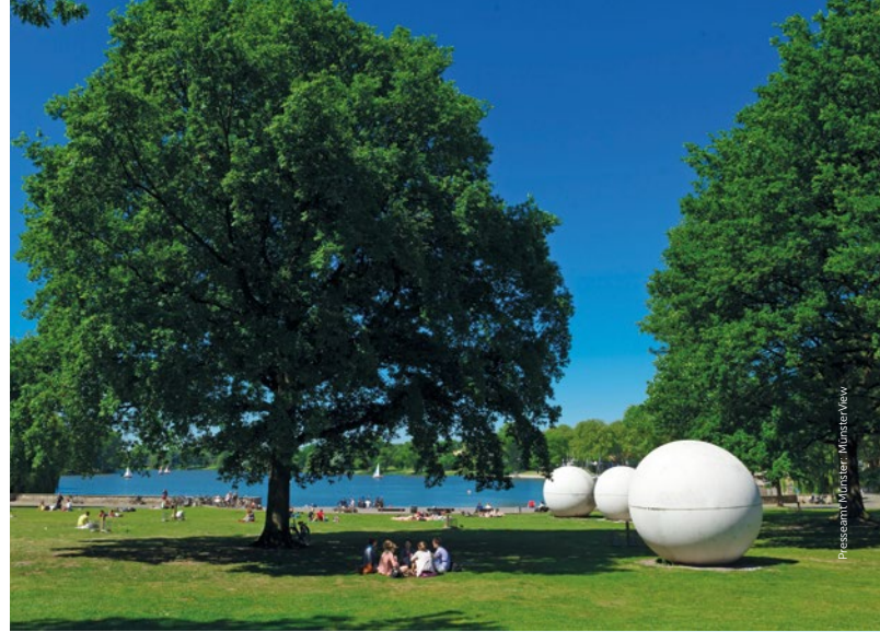
Picasso Museum, Münster View

Muenster has a catholic bishop and is very well known as a bicycle-city. The reconstructed historic city centre impresses with its important gable houses. The city is surrounded by a five kilometer long green belt – also known as Promenade – where you can always find runners. Muenster's Aasea is located closely to the city centre and invites you to go for a walk, a run or a sailing tour. The Aasea as well has the harbor area with its bars, nightclubs and leisure activities are famous meeting places for every generation. The city centre with the Prinzipalmarkt, Lambertikirche (church) and historic town hall invites you to go for a stroll. The variety of close by stores leaves no wish unfulfilled. Performances at the theatre, artistic shows, live concerts, museums, cinemas, readings – Muenster has something to offer for all ages and tastes.